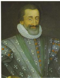
Henry IV of France

The Crusades stimulated trade between western Europe and the Middle East and Eurasia. The crusaders brought back many things that were new to Northern Europe: lemons, apricots, sugar, and cotton. Superbly symmetrical, lustrous pearls from the East were among the most valuable of the rare and exotic objects to travel west. Their value was due in part to the difficulty of harvesting and matching pearls, as well as their natural lustrous finish, glow and brilliance.