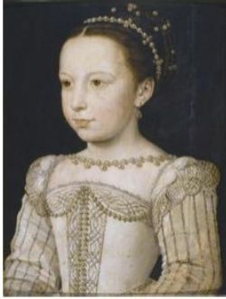
Marguerite of Valois François Clouet, Chantilly

nobility posed for portraits in their finest clothing studded with pearls, with strands of pearls dripping from their necks. Extravagant displays of pearls became a symbol of wealth and standing. Sumptuary laws were even enacted to limit ownership of such ostentatious finery to people above a certain social station. (In England, for example, those above the rank of Companion of the Garter took full advantage of their exemption from these restrictions.)