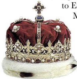
The Crown of Scotland Edinburgh Castle

The love of pearls began thousands of years ago. Alexander the Great's eastern conquests brought pearls from lands as far east as the Persian Gulf and India westward to Europe, where they rapidly became highly sought after. During the Middle Ages, many pearls came from the Red Sea, the Persian Gulf area and the Gulf of Mannar off the coast of India. Britain also had a substantial freshwater pearl industry. Excellent quality freshwater pearls were found in Scotland, created by river-dwelling mussels. The Crown employed river bailiffs to supervise the gathering of these mussels and make sure that all valuable pearls found reached the king's treasury. The Kellie pearl, the largest pearl ever discovered in Britain was found in 1621, and is probably part of the Scottish crown jewels.