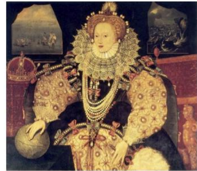
Elizabeth I Armada Portrait George Gower, Woburn Abbey

Queen Elizabeth I probably brought the love of pearls and their extravagant display to their zenith. The queen not only enjoyed their glowing beauty, but used their symbolism of purity to excellent effect as part of her public image. In George Gower's "Armada" portrait (painted after England's defeat of the Spanish Armada), Elizabeth is literally draped in pearls, with pearls embroidered onto her dress and decorating her wig. The magnificent six-strand pearl necklace is part of a collection called the Hanoverian pearls, said to date to the 14 th century. Elizabeth bought the entire collection, which included dozens of loose pearls, from the estate of Mary Queen of Scots. It was rumored that Elizabeth owned more than 3,000 pearls.