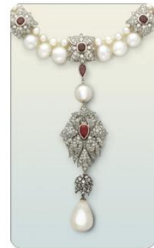
la Peregrina pearl in a Cartier necklace

The popularity of pearls in personal decoration in Europe continued to increase during the medieval centuries. By the 13 th and 14 th centuries pearls were integral to personal adornment throughout Europe, and were worn both by men and women. Pearls were not only used in jewelry but also incorporated into hair ornaments and sewn onto formal dresses and other garments worn on special occasions. Young European maidens of royalty wore long strands of pearls, while men used mother of pearl in their weapons and armor, believing that it would protect them from harm and bring them luck. Royalty and